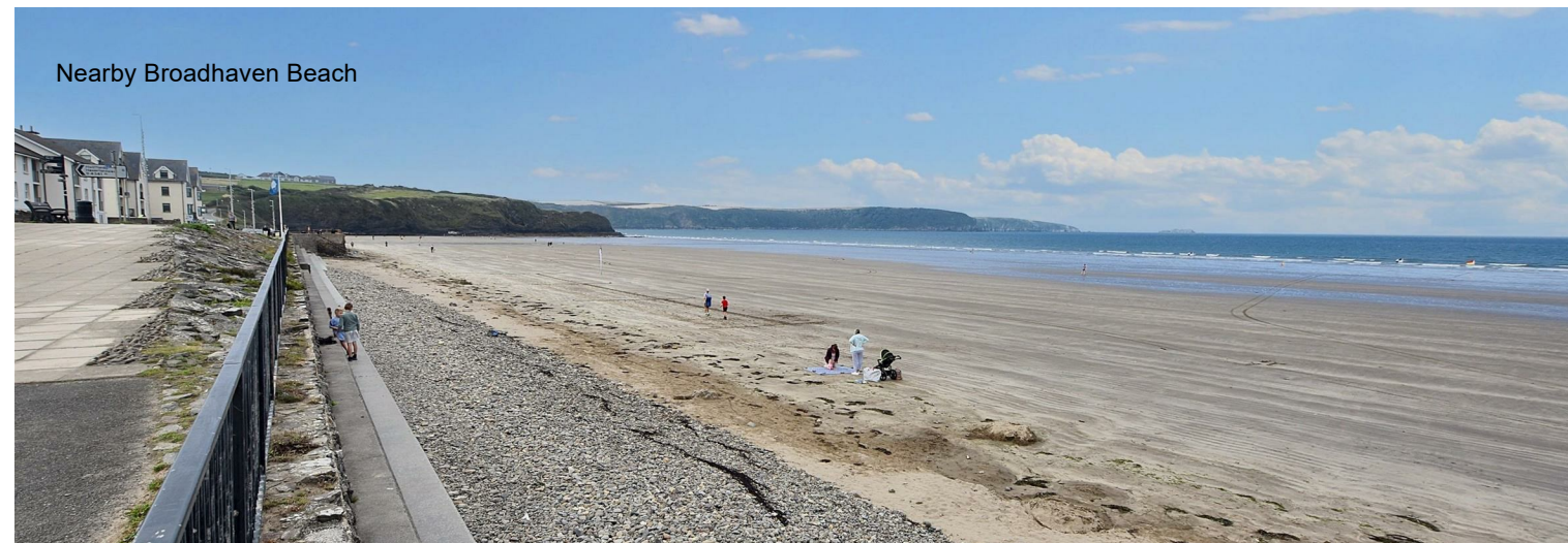
Nearby Broadhaven Beach